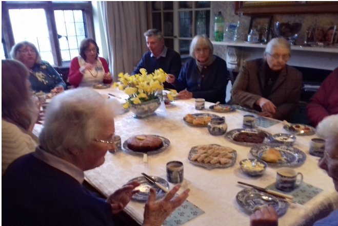
Photo of the Filmshow tea.