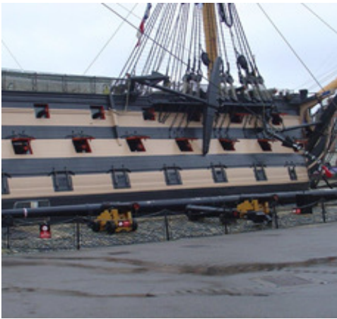
HMS Victory in her new colours and Pavilion work in the snow